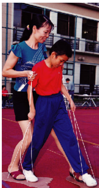
以開放的態度接納家長的意見，並鼓勵家長參與學校活動。 Acceptar as opiniões dos pais com abertura e incentivar-las a participar nas actividades da escola. Welcome & accept the parents' suggestions while encouraging them to participate in the school activities.

CENTRE OF EDUCATIONAL ACTIVITIES OF TAIPA Tel: 841284