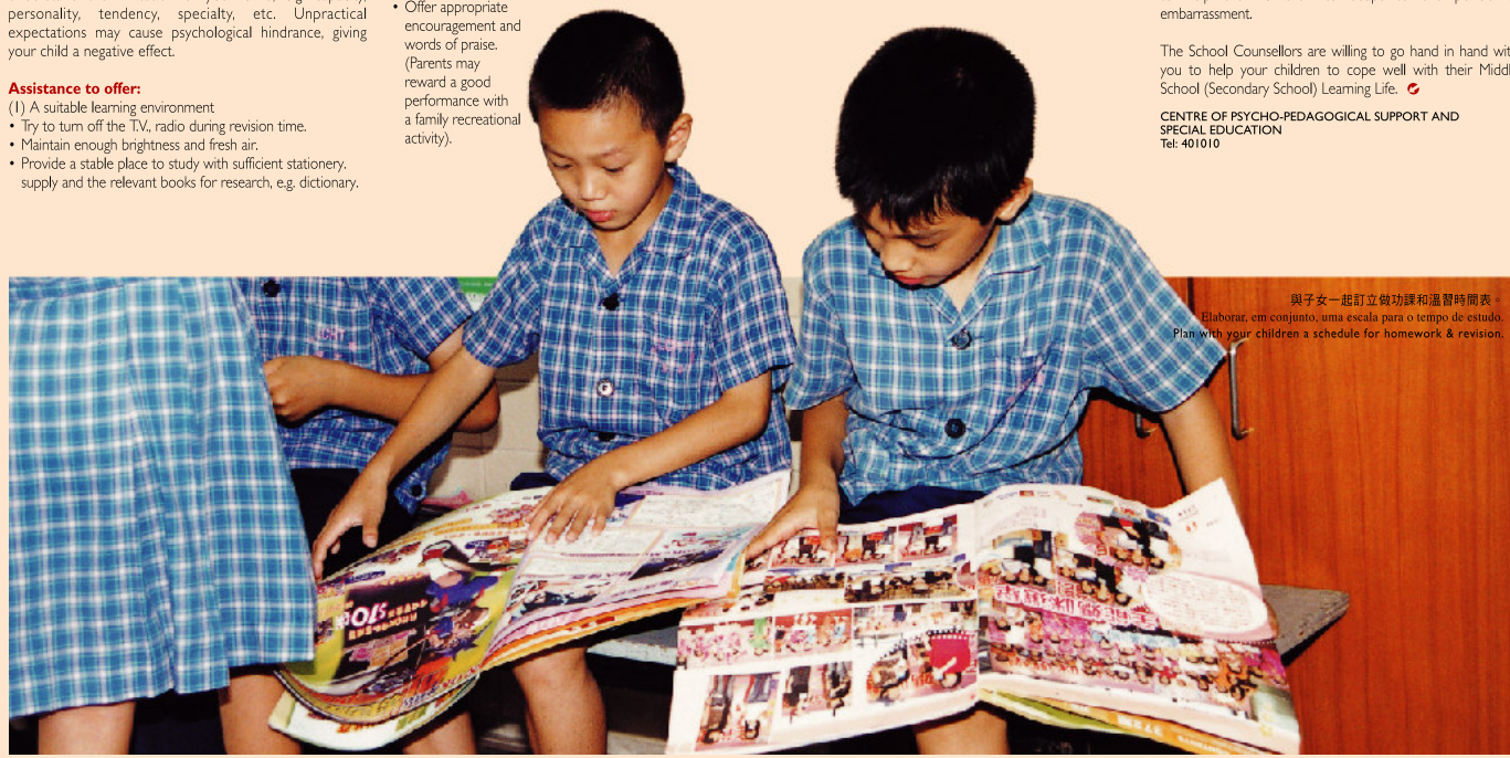
與子女一起訂立做功課和溫習時間表。 Elaborar, em conjunto, uma escala para o tempo de estudo. Plan with your children a schedule for homework & revision.

CENTRE OF PSYCHO-PEDAGOGICAL SUPPORT AND SPECIAL EDUCATION Tel: 4010