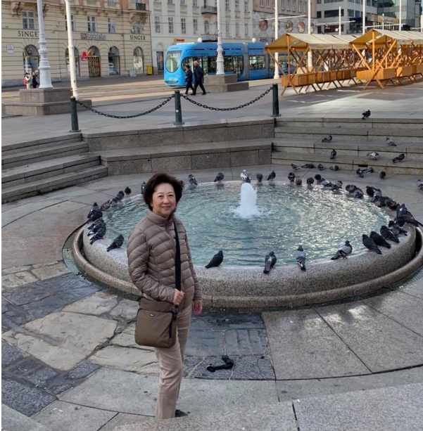
Picture 1: The name Croatia means “Bring water”. This is where the name Croatia was first created.